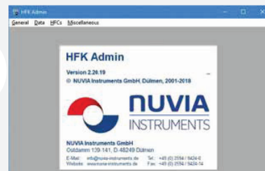
Admin Software For remote data administration and parameter setting