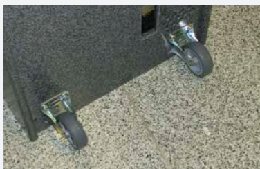
Transport Wheels Mounted castors and hand grip